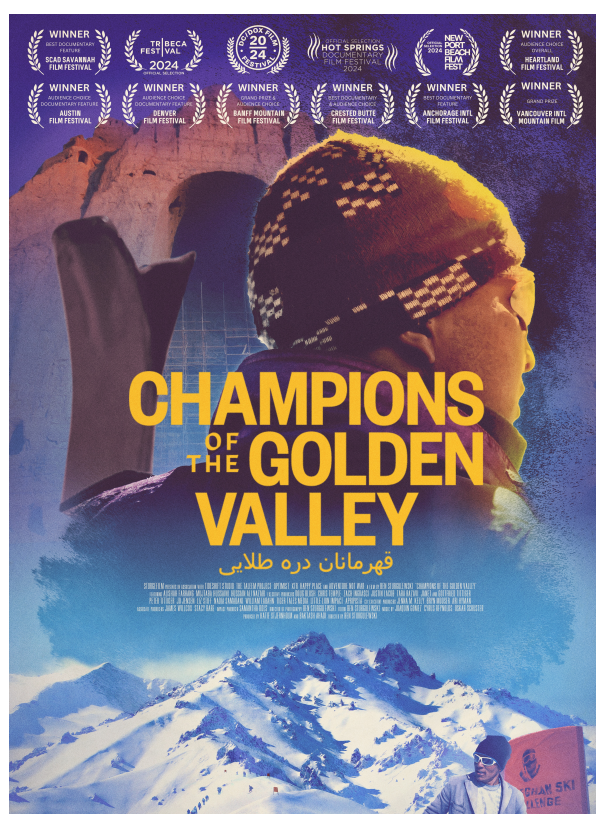
August 10 CHAMPIONS OF THE GOLDEN VALLEY

Set against the backdrop of 2024's total solar eclipse, this film follows the community of Houlton, Maine, as they come together to host an influx of strangers arriving to experience the path of totality. 77 mins.