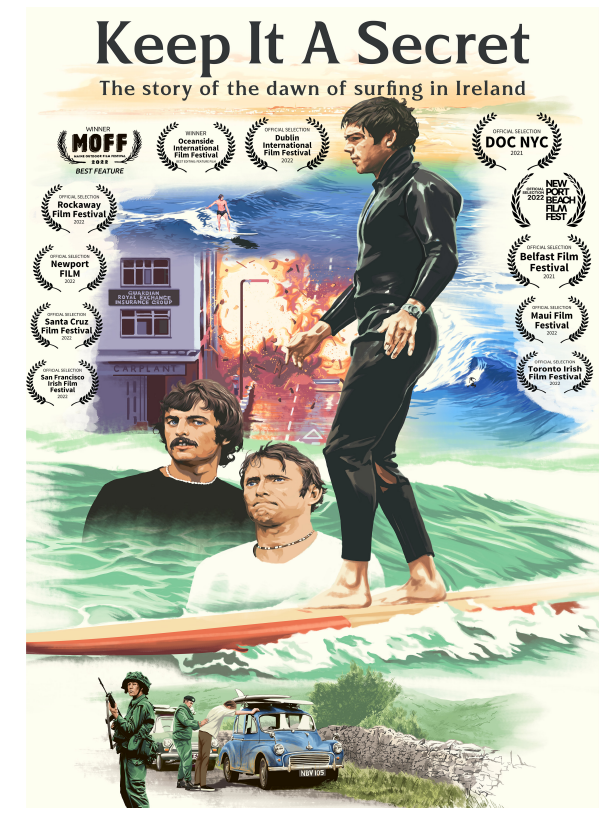
July 6 KEEP IT A SECRET

Sundays in Discovery Park, starting at 7 p.m. Food trucks serving from 11 a.m.-7 p.m.