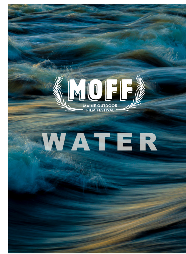
August 31 MOFF SHORTS: WATER

The mountains rise in Discovery Park for this showcase of exhilarating outdoor adventure shorts from the 2025 Maine Outdoor Film Festival. 75 mins.