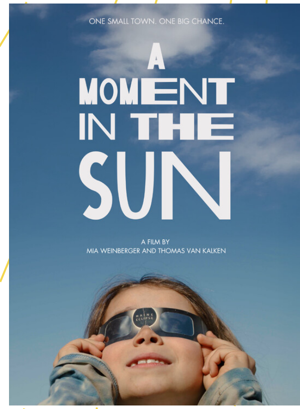
August 3 A MOMENT IN THE SUN

Follows the collective ambitions of 15 of the world's best freeride mountain bikers across forests, deserts, cities, and high-alpine peaks. 57 min.