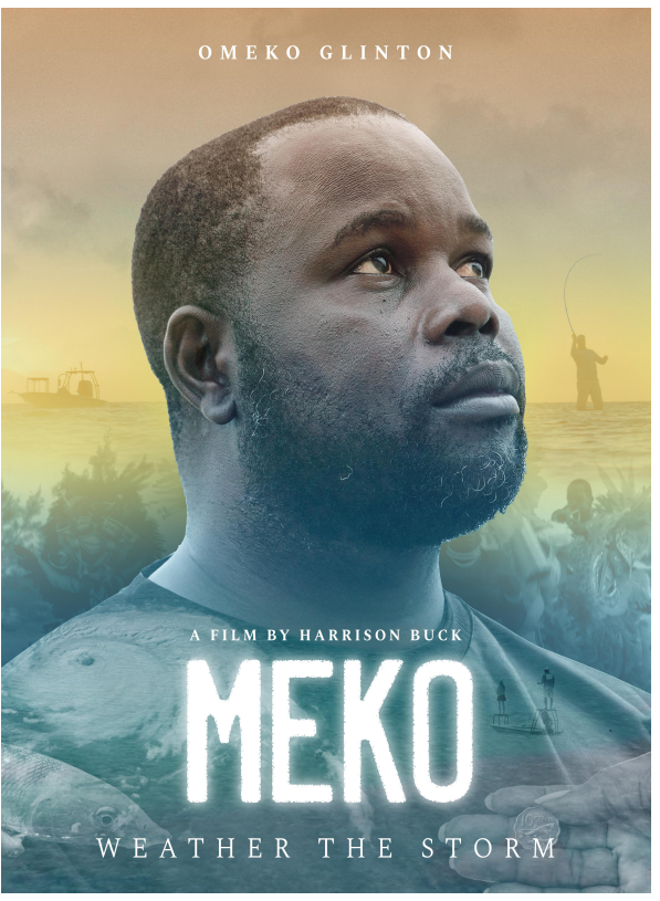
July 13 MEKO

The inspiring true story of the dawn of Irish surfing and how the sport's brave pioneers found peace in the surf during the most violent years of The Troubles conflict. 61 mins.