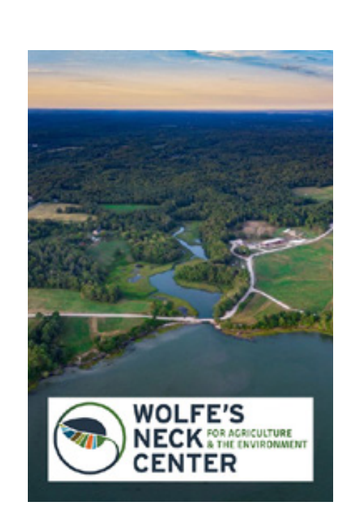
August 27 SPEAKER: WOLFE'S NECK CENTER

Groundswell provides an in-depth look at the 2021-22 big wave season through the eyes of legendary and pioneering surfers.