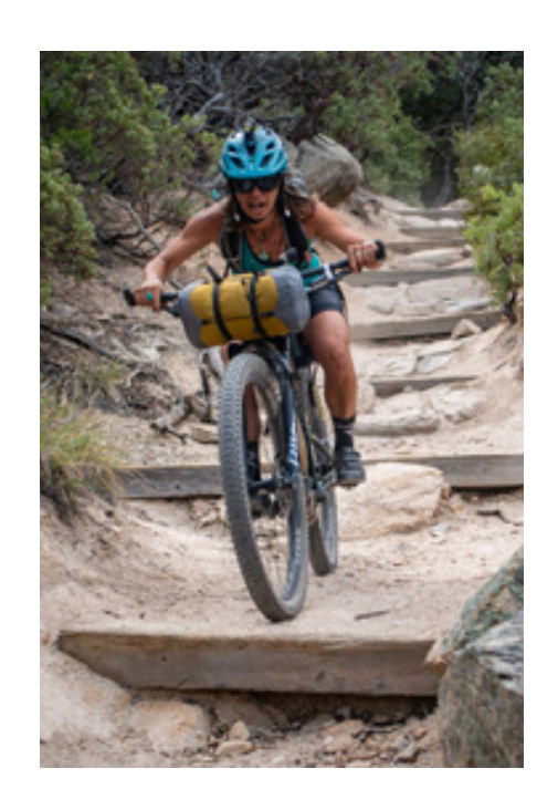
JULY 30 WOMEN'S ADVENTURE FILM TOUR

Watch Bill Yeo's newest film, Bike Packing Colorado, then listen as he recounts his moments of triumph and travail on the Colorado Trail, one of the country's most grueling - yet beautiful - rides.