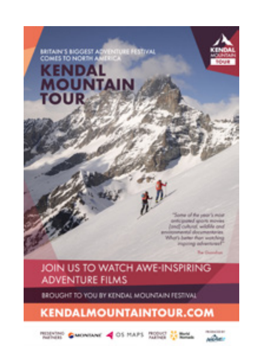
August 13 KENDAL MOUNTAIN FILM TOUR

Learn about the baker's dozen of invasive plants that threaten Maine's natural areas - and your backyard!