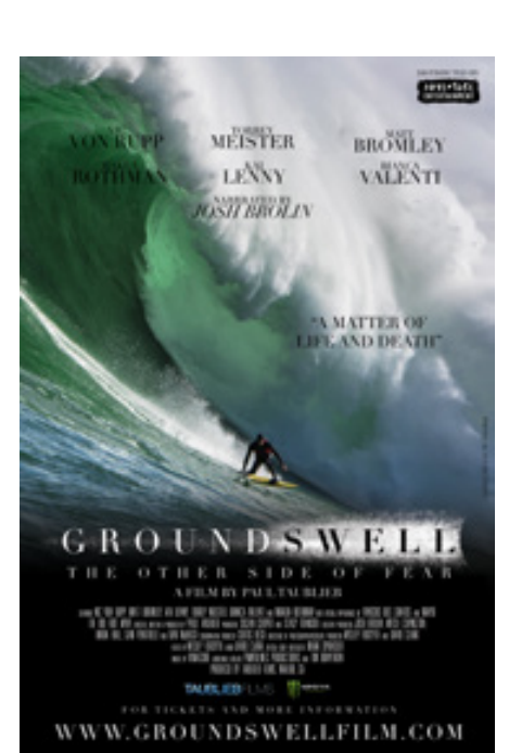
August 20 FILM: GROUNDSWELL

After 42 years, Britain's biggest adventure film festival comes to North America for the first time, featuring everything from international film premieres with the world's greatest athletes to new voices entering the outdoor sphere.