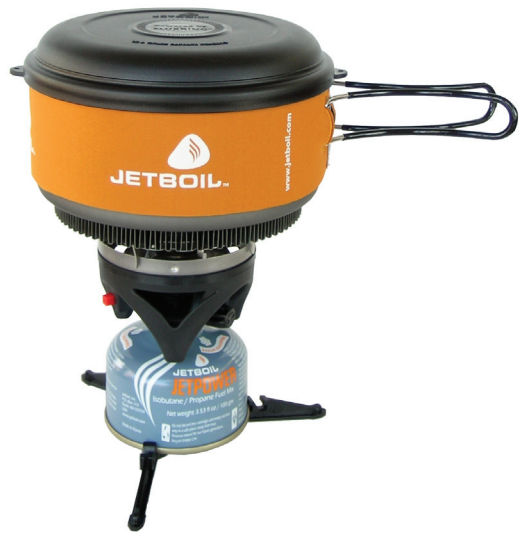
Group Cooking System (GCS)