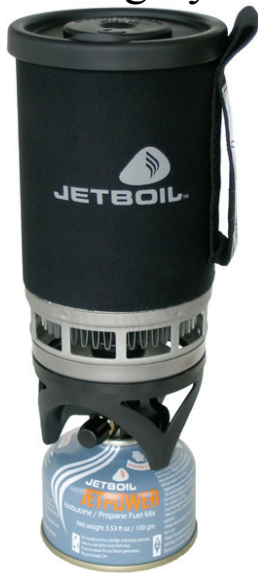
Personal Cooking System (PCS)