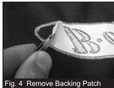
Fig. 4 Remove Backing Patch