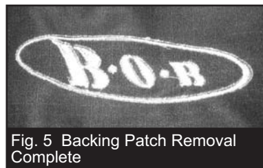
Fig. 5 Backing Patch Removal Complete